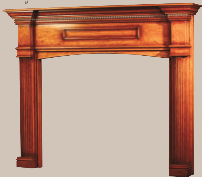
Burnt Sienna Glaze on Cherry