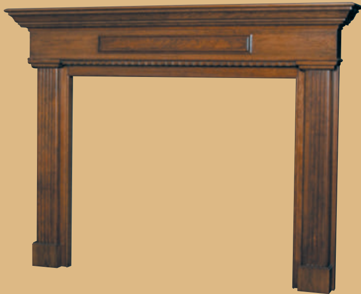
Walnut color on Cherry