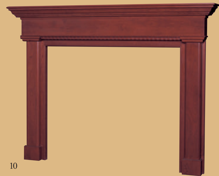
Chestnut color on Cherry