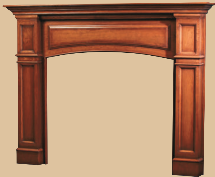
Coffee Bean Glaze on Cherry