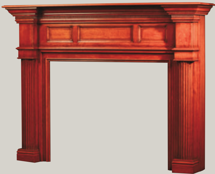
Cordovan Glaze on Cherry