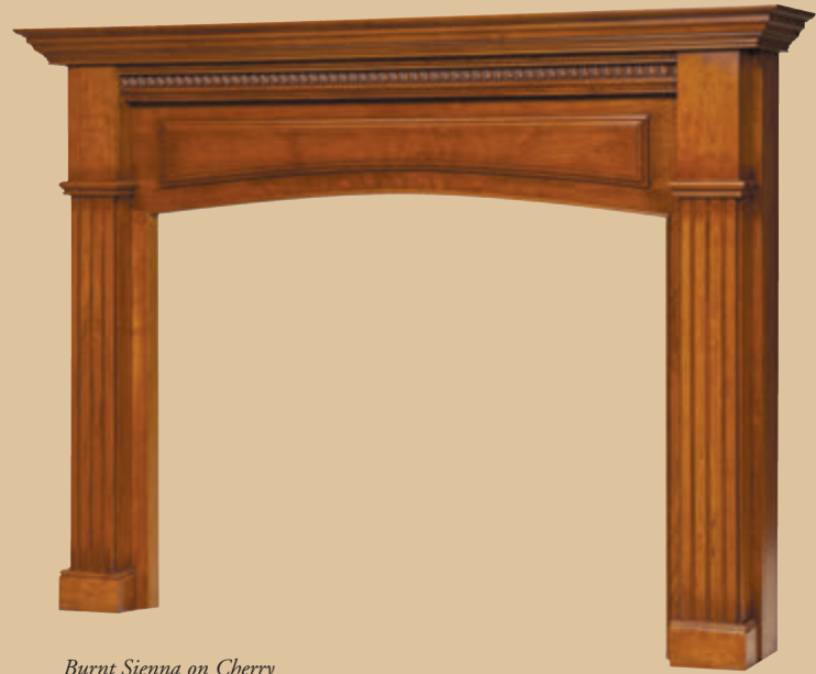
Burnt Sienna on Cherry